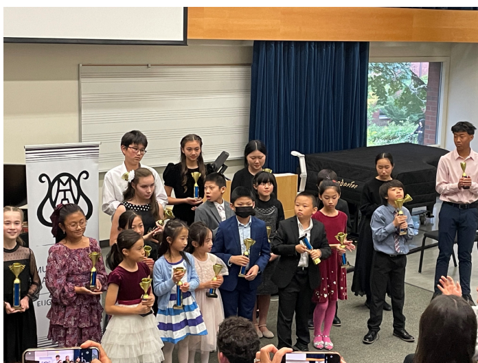
Sonatina Festival 2025 trophy recipients