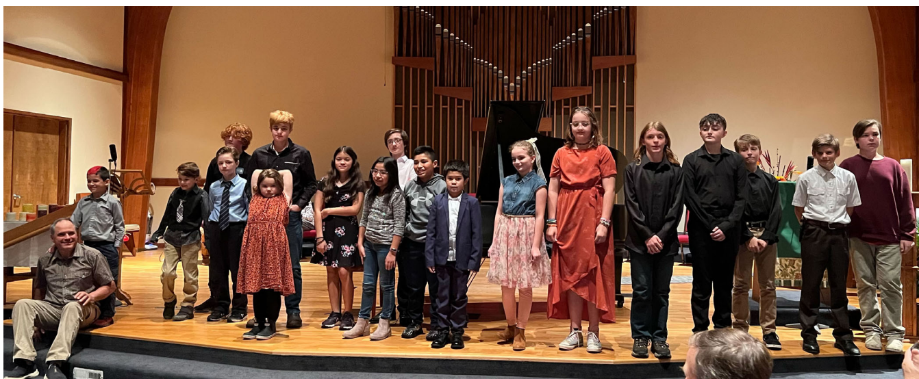
Lincoln County Ensemble Festival