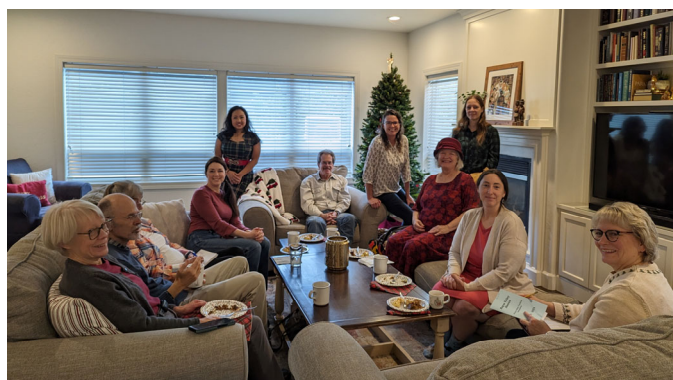
Rogue Valley District Holiday Get-Together