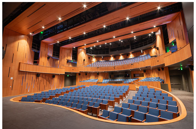
550-seat theater at The Reser in Beaverton, OR