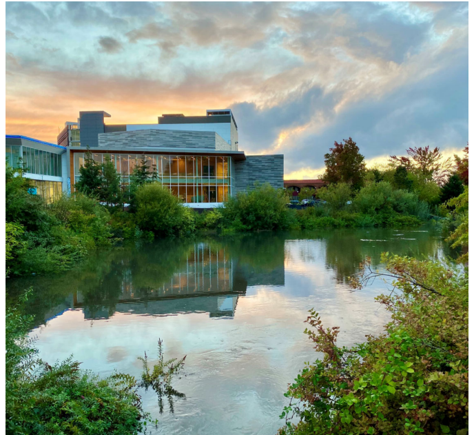
Patricia Reser Center for the Arts (PRCA)